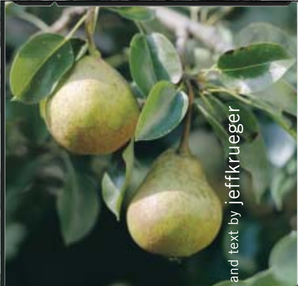
photographs and text by jeffkrueger